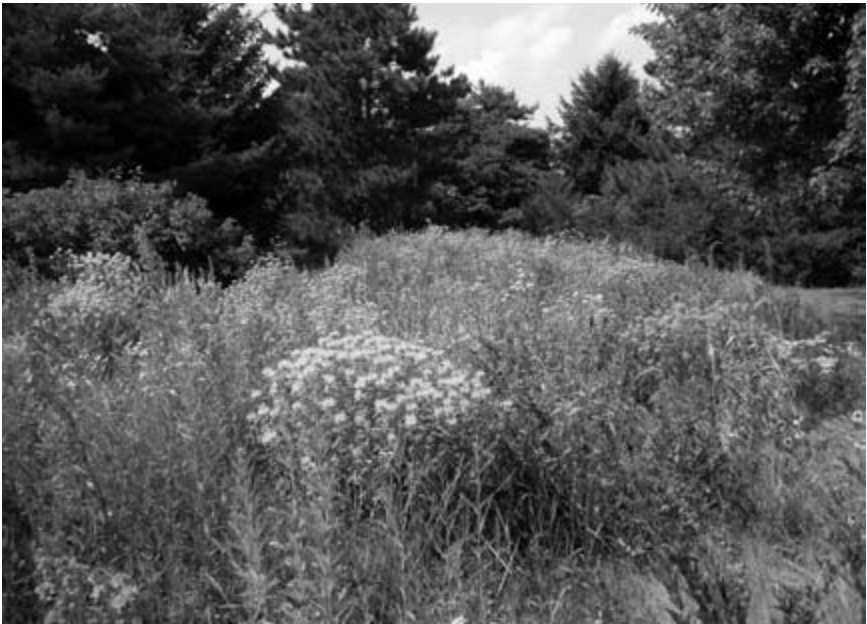
Fig. 13-8. Wild bergamot is most conspicuous, but the planting in its third growing season begins to exhibit quite a bit of diversity, with many other plants starting to show up as well.