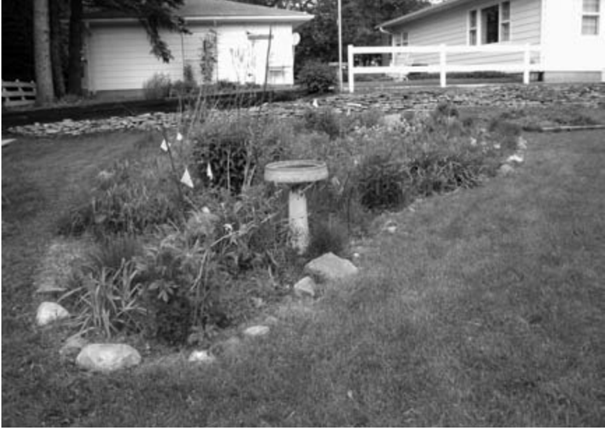
Fig. 13-4. In the spring when plants are small, tallgrass prairie plantings can resemble a traditional garden.