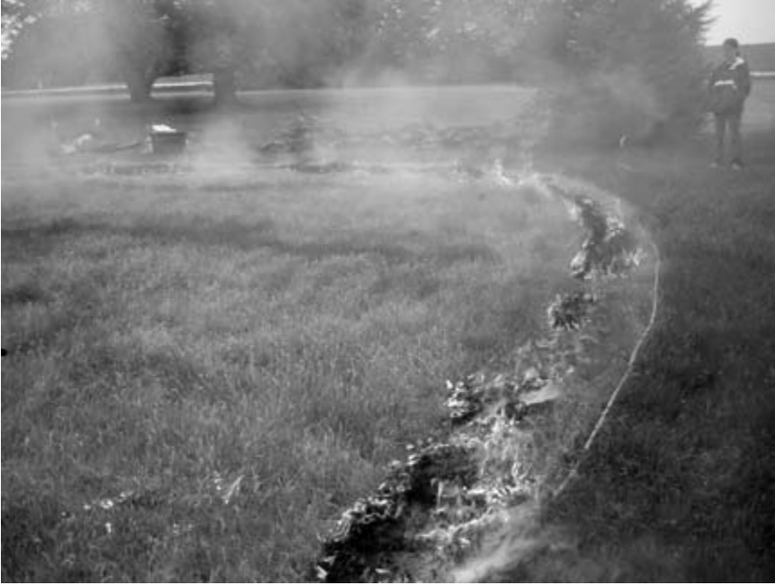
Fig. 13-2. Conducting a prescribed burn helps get dead plant material out of the way prior to seeding.

weeds and reducing maintenance is to have all available space occupied by native plants right away. To that end, plant at least 80 seeds per square foot. Very roughly, that would be 8 ounces of pure live seed for 1,000 square feet. On large, level planting sites, that would be a heavy and unnecessarily expensive rate of seeding. On small plantings, it amounts to affordable insurance.