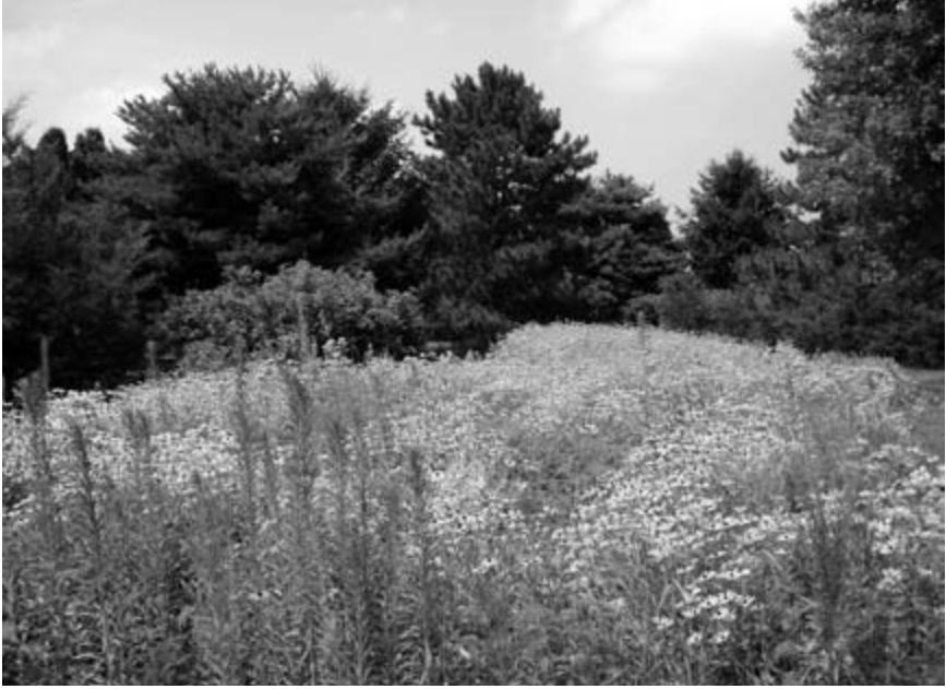
Fig. 13-7. The second growing season brings on an explosion of black-eyed Susan. This is the only year the planting will look like this.