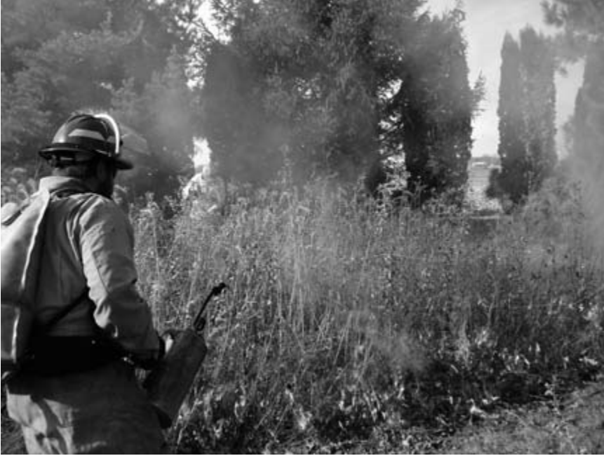
Fig. 13-9. By the fourth growing season, biomass at ground level provides enough fuel to carry the fire. Fire helps eliminate a heavy build-up of thatch.

During the second year (fig. 13-7), fill bare spaces with additional seed or with transplants. By the third or fourth growing season, some of the established plants can be divided and used to fill bare areas and improve distribution. Random weeds should be pulled or snipped off with hand trimmers before they produce seed or get too well established.