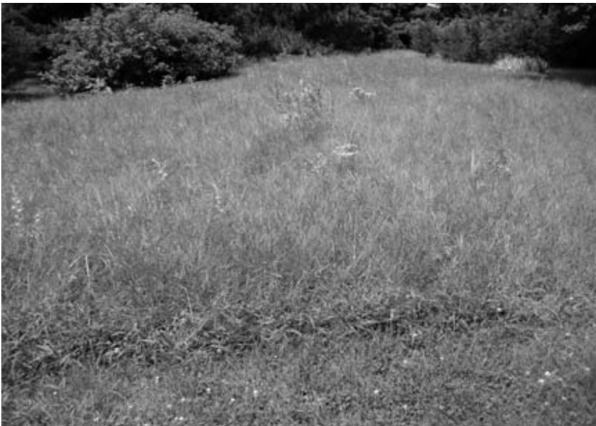
Fig. 13-6. It's difficult to anticipate what weed species will be released when existing vegetation is removed. Shown in late July, this planting is dominated by crab grass during its first growing season.

During the first growing season, prairie plants invest their energy sending down roots; they exhibit very little above-ground growth (fig. 13-6). During the first year, these tiny seedlings are at risk of being shaded out by tall weeds. Prairie seedlings can be difficult to identify also. This increases their chances of being disturbed or accidentally removed during any hand-weeding. The safest way to control weeds is to mow the planting to a height of 4 to 6 inches every 3 weeks throughout the first growing season. Weeds squeezing through the holes made in weed barrier should be snipped off instead of pulled. If irrigation is possible, turn on the sprinkler hose with the goal of providing an inch of water every week.