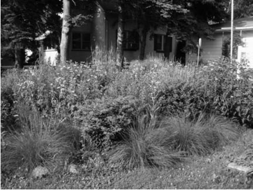
Fig. 13-3. The prairie dropseed plants in the foreground are at full height and are as attractive as any ornamental grass.

In small prairies where diversity is the goal, go easy on the taller grasses. For big bluestem, use no more than one-fourth ounce of pure live seed per 1,000 square feet. The same goes for Indian grass. Seed little bluestem and side-oats grama each at an ounce of pure live seed per 1,000 square feet. And try to work in some prairie dropseed, a beautiful, shorter-growing native grass, best started from live plants (fig. 13-3).