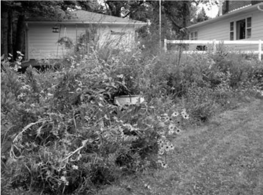
Fig. 13-5. By late summer, the same planting resembles a small piece of wilderness.