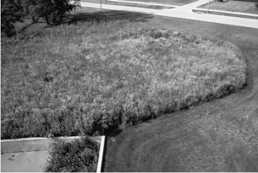
Fig. 13-1. The mowed border parallels the street and curves back to the building, allowing for a traditional mowed lawn between the building and the street.

all or some of its borders, or use the planting as a transition zone between a mowed area and taller trees and shrubs (fig. 13-1).